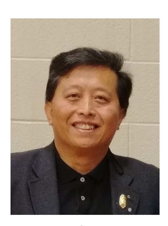
Grand Knight's Message